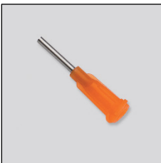
Part# 8514320 Tip #15 Gauge with Safety Lock Attachment .059" x 1/2"