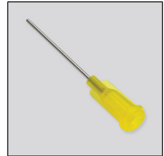
Part# 8514325 Tip #20 Gauge with Safety Lock Attachment .025" x 1"