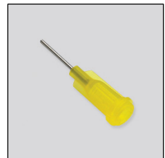
Part# 8514324 Tip #20 Gauge with Safety Lock Attachment .025" x 1/2"