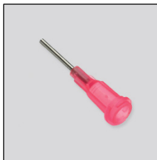
Part# 8514322 Tip #18 Gauge with Safety Lock Attachment .038" x 1/2"