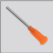
Part# 8514319 Tip #15 Gauge with Safety Lock Attachment .059" x 1"

Single-use wand tips ensure the highest level of sanitation. Cross-contamination is eliminated with single-use. To ensure a proper seal MedRx supplied tips are recommended.