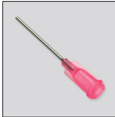
Part# 8514321 Tip #18 Gauge with Safety Lock Attachment .038" x 1"